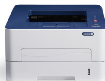
Phaser 3052. Print.