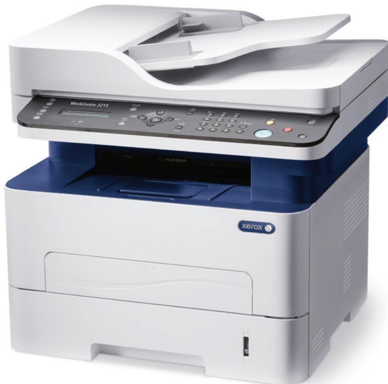
WorkCentre 3215. Copy. Print. Scan. Fax. Email.