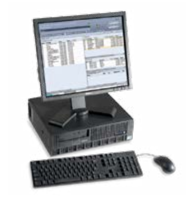
Xerox® FreeFlow® Print Server

Each server is designed to meet a specific set of workflow and application requirements. Your Xerox representative will help you choose the one that best suits your needs.