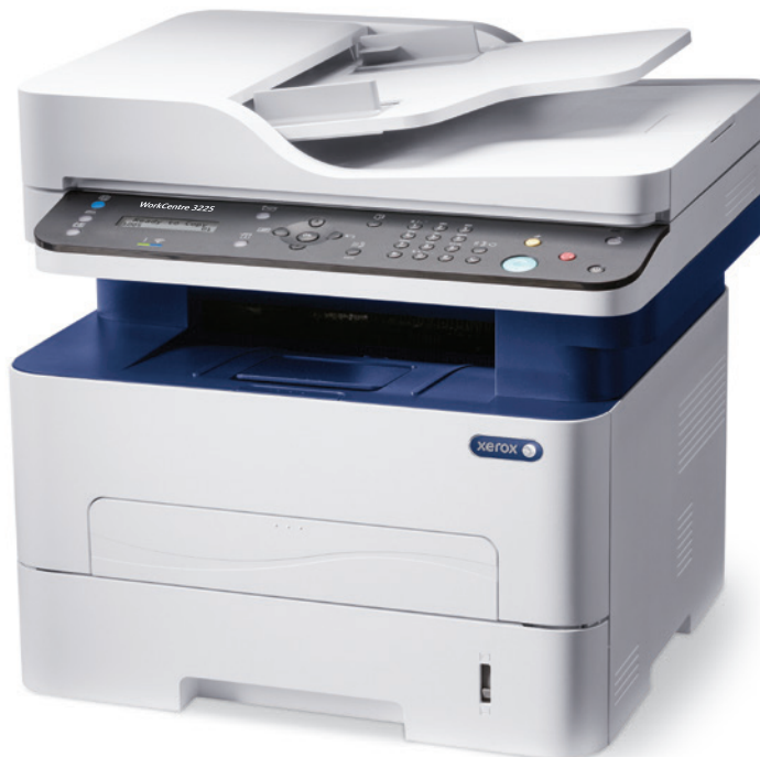
WorkCentre 3225. Copy. Print. Scan. Fax. Email.